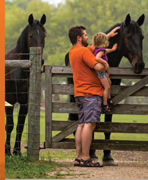
Motherwell Homestead National Historic Site GPS Coordinates: 50°43'04.3"N 103°25'28.5"W