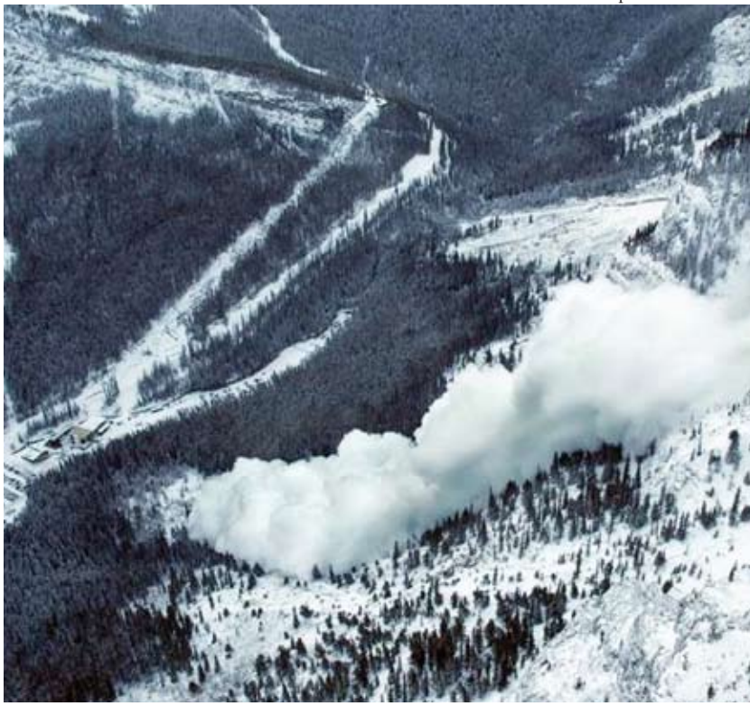
Avalanche over Bourgeau Right-Hand