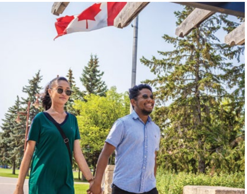
Jacelvn Heritage Presentation

My favorite spot is the Caron Home at Batoche National Historic Site in Saskatchewan. Still standing from 1895, this house gives the perfect glimpse into Métis homesteading life and the resiliency of the Métis people in Batoche. Learn about life during the Battle of Batoche and the recovery of the village after the events of 1885. My own ancestors lived on the next river lot over, so I feel literally close to home there!