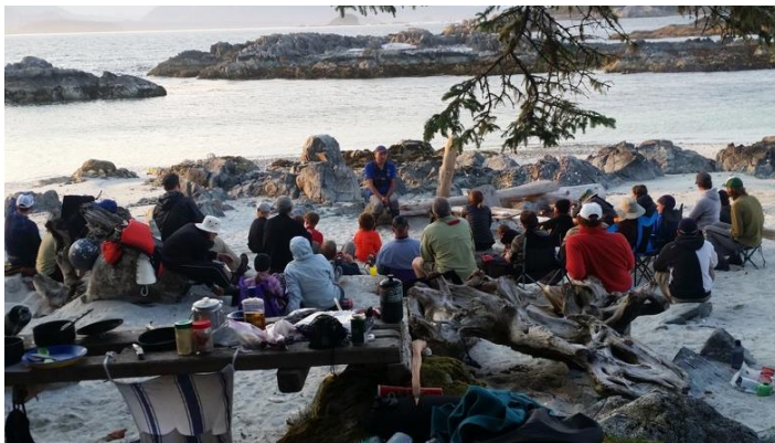
Photo: Staff running educational programming