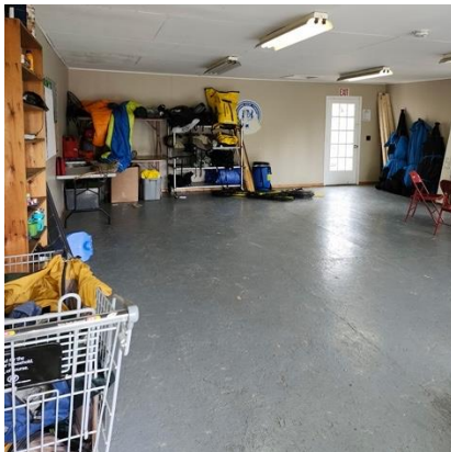
Photo: gear maintained by The Stewardship Guild of Rama First Nation

The programs are incredibly meaningful to the Guardians, partners and community members. The programs provide them with the opportunity to be on the land, and manage the land in a reciprocal way that benefits all – First Nations communities, Non-Indigenous community members, the wildlife and natural resources.