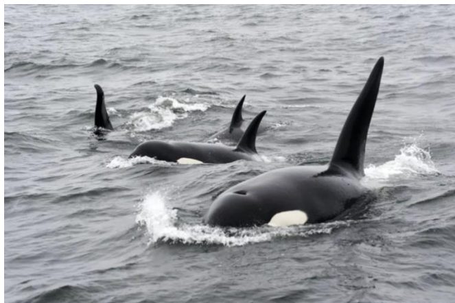
Photo: keḻtolemećen courtesy of the QENTOL, YEN W̱SÁNEĆ Marine Guardians program