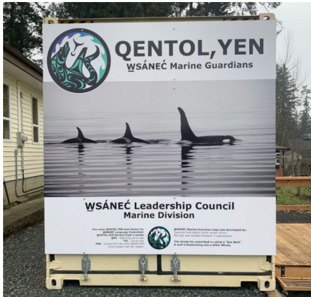
Photo: signage at that QENTOL, YEN W̱SÁNEĆ Marine Guardians office site.