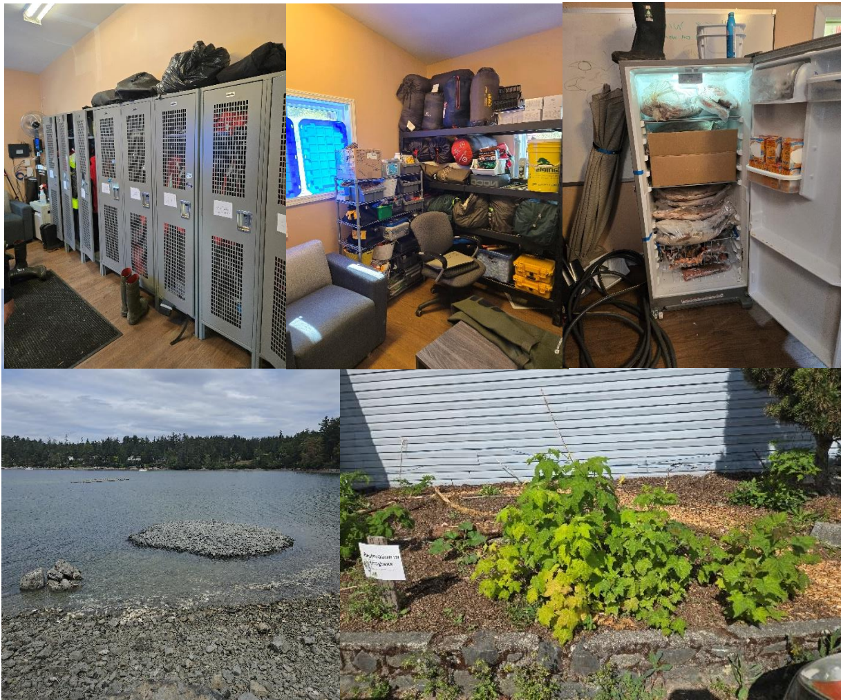
Photos from Pauquachin First Nation Marine Guardians.

Top left to right: – workers gear, camping gear, and community fish supply.