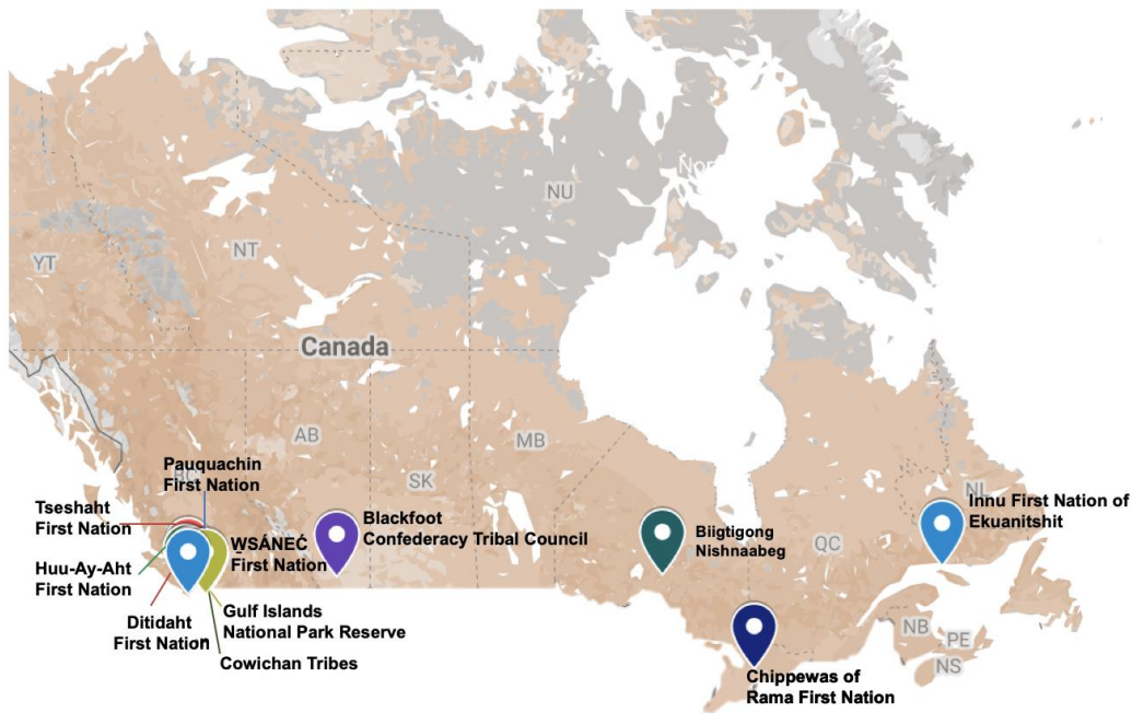
Figure 1: Map of the Guardians Programs Across Canada who participated in this research.

Ten Guardians programs participated in the research, six of which are located in British Columbia, one in Alberta and Quebec respectively, and two in Ontario. The map and table below illustrate the coordinates/location of each First Nation responsible for their program.