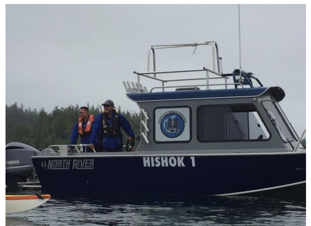
Photo: Staff on monitoring/transportation boat