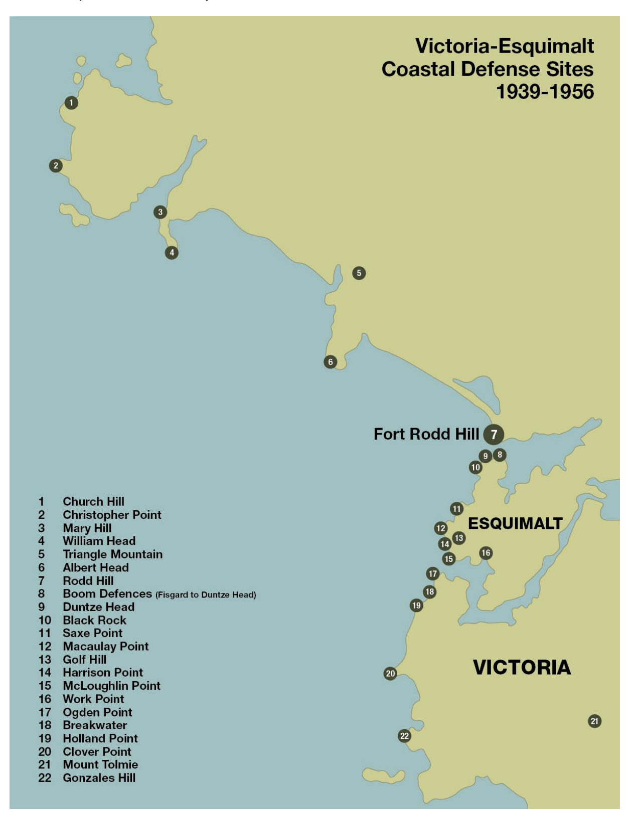
Appendix A Victoria-Esquimalt Fortification System