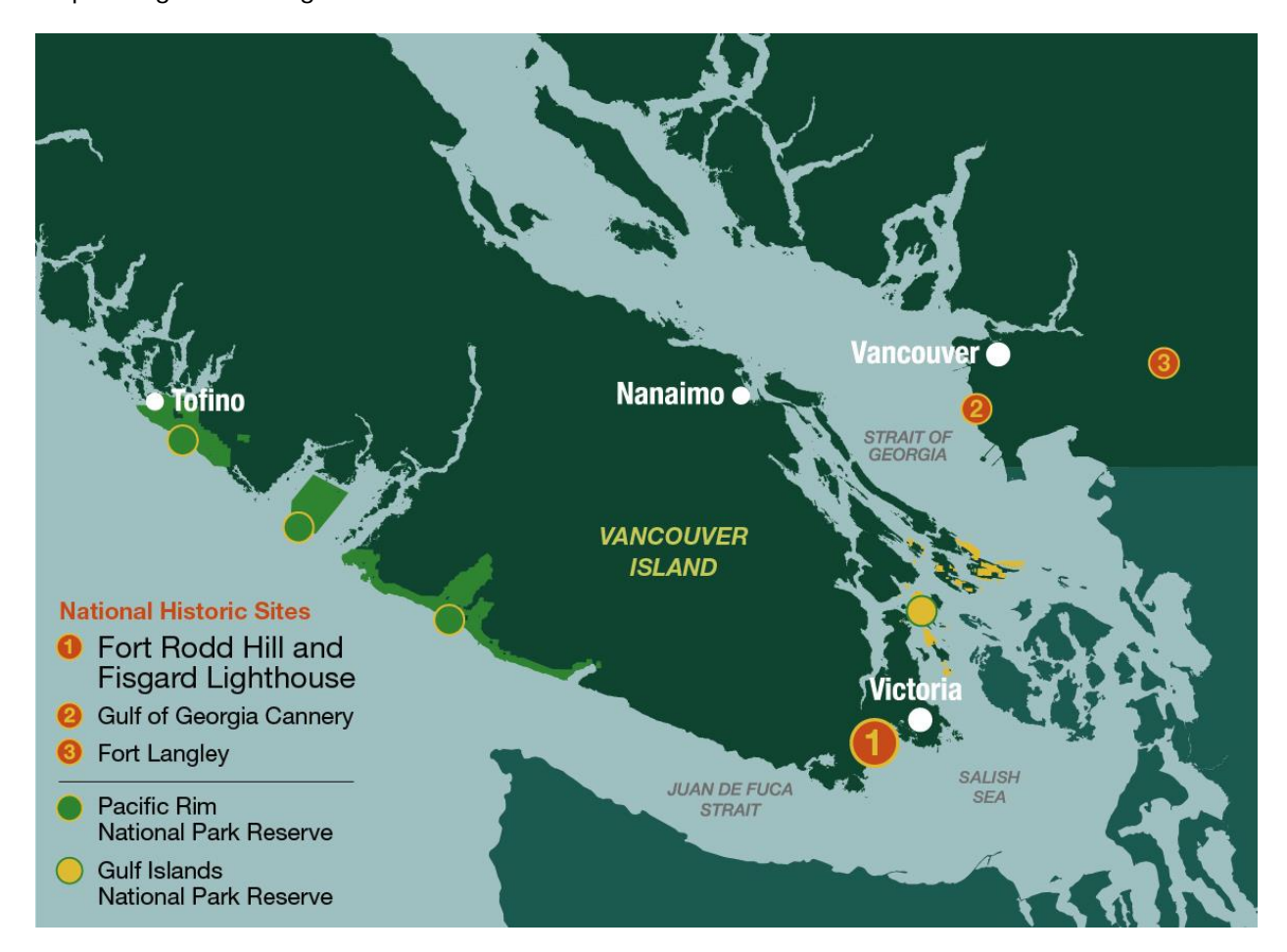
Map 1: Regional Setting

Lighthouse is guided by Parks Canada's system plan for national historic sites, a Framework for History and Commemoration . This framework outlines a more inclusive, accessible and engaging approach to Canada's history. Extending the stories that are told at heritage places, beyond their original commemorative intent for designation, allows for more narratives, perspectives and voices to be heard. Parks Canada's priority is to share Indigenous peoples' history and experiences.