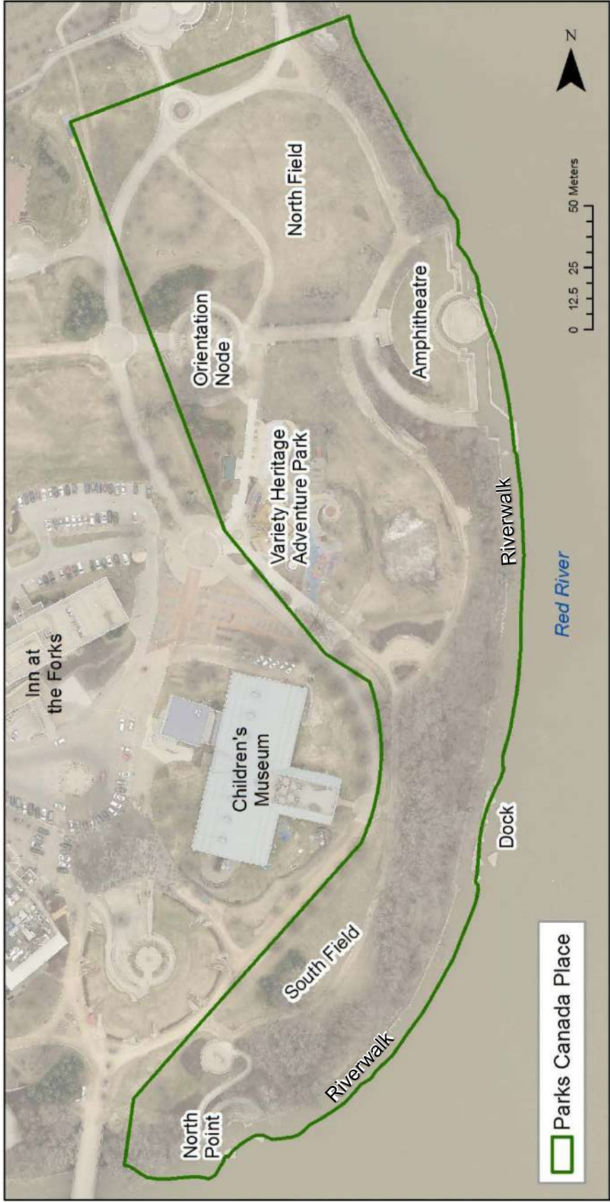
Figure 2 Parks Canada Place Facilities at The Forks NHS. Parks Canada 2017.