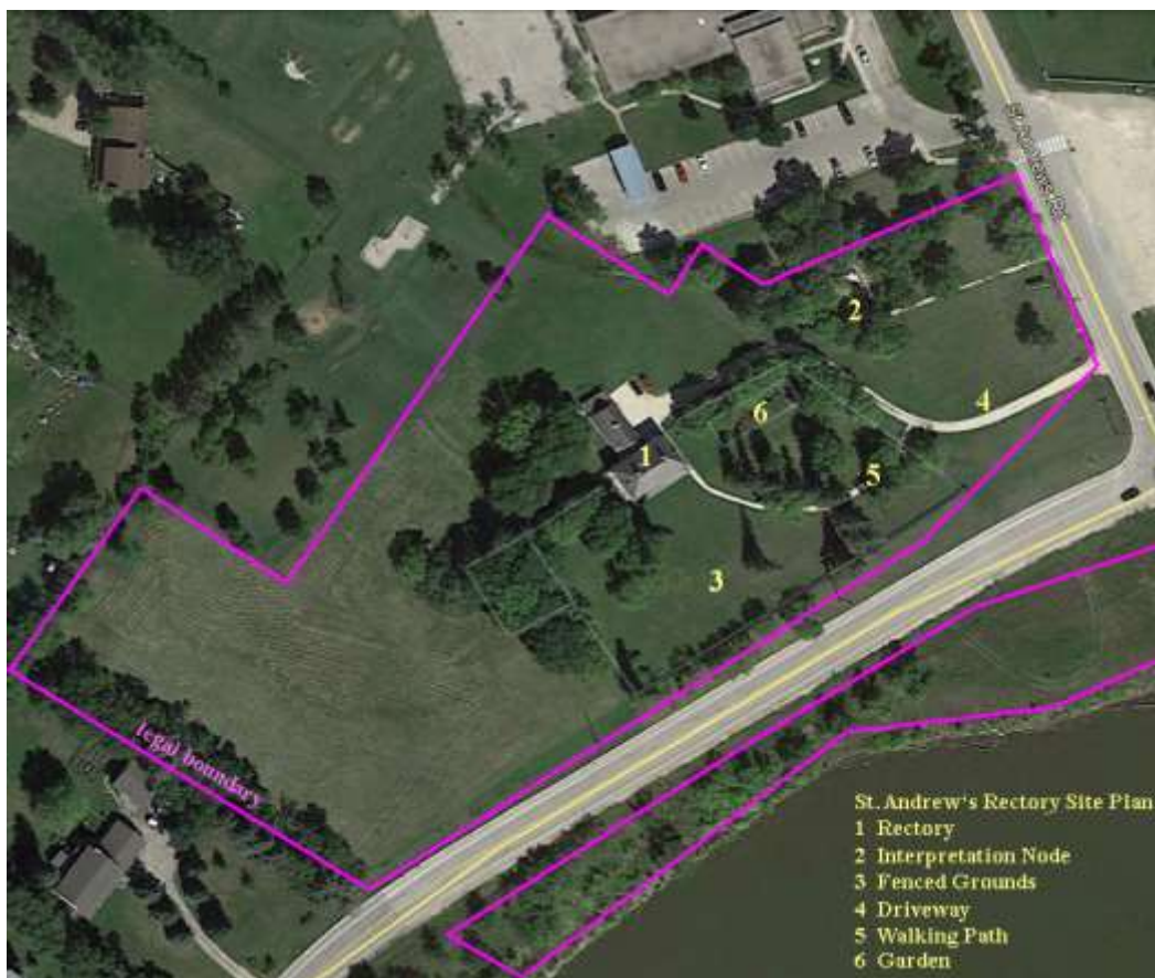
Map 2. St. Andrew's Rectory National Historic Site. Parks Canada 2021.