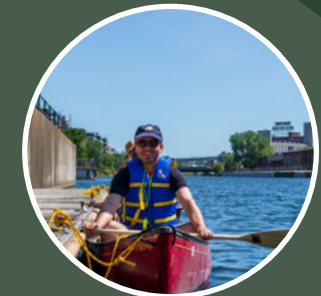
Outdoor education programs

Since 2018, Parks Canada has offered a variety of activities through its introductory camping , paddling , and snowshoeing programs (Objective 4.2). In both summer and winter, the agency has introduced several thousand people to the basics of these activities by partnering with various partners, such as MEC.