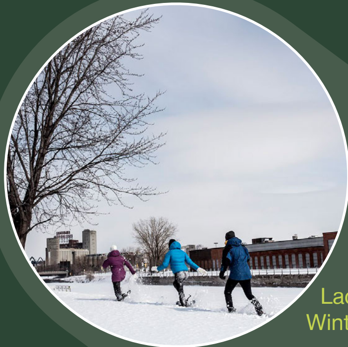
Lachine Canal Winter Trail

In the summer of 2021, 37 sections of the Lachine Canal's multifunctional path were repaired in order to increase the fluidity and safety of users and to improve the experience of visitors who use it (objective 2.3).