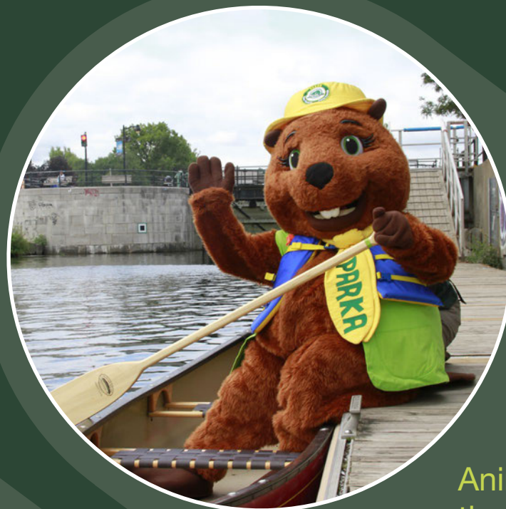
Animation of the banks of the Lachine Canal

From 2018 to 2019, Parks Canada participated in the annual swearing-in of 200 new Canadian citizens (Objective 4.1). Among other things, the Agency gave them free access to its sites during the first year of their citizenship.