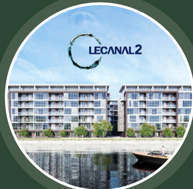
Le Canal 2