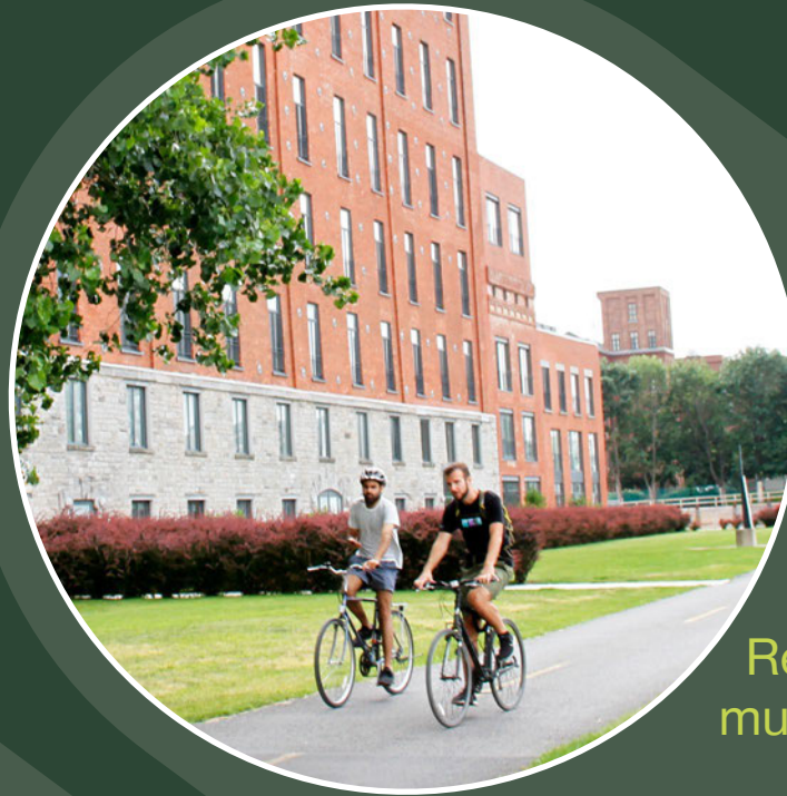
Repair of the multipurpose path

Parks Canada has added a new one-kilometre section of multi-purpose path between Atwater Avenue and Des Seigneurs Street. The North Link is enhanced with gathering areas and a service building (Hangar 1825). This project is intended to enhance the visitor experience in this area (Objective 2.3).