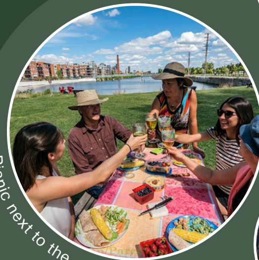
Picnic next to the canal

Parks Canada has been working hard since the adoption of the Lachine Canal National Historic Site Management Plan (2018) to achieve the strategic vision, despite the context of the COVID-19 pandemic (March 2020). In addition to repairing its infrastructure, animating the canal banks, organizing cultural events and setting up judicious collaborations with a variety of local partners, the Agency also works to respond to the many applications that have direct impacts on the safety of users and the commemorative integrity of the Lachine Canal National Historic Site.