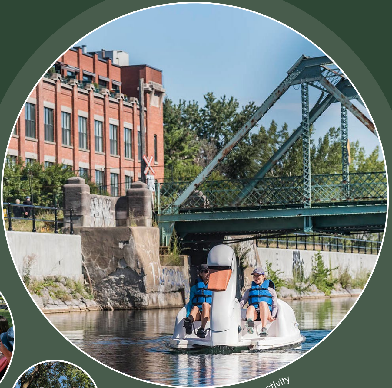
Non-motorized navigation activity