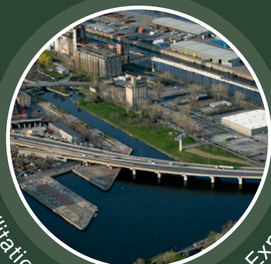
Rehabilitation of the Bonaventure Expressway