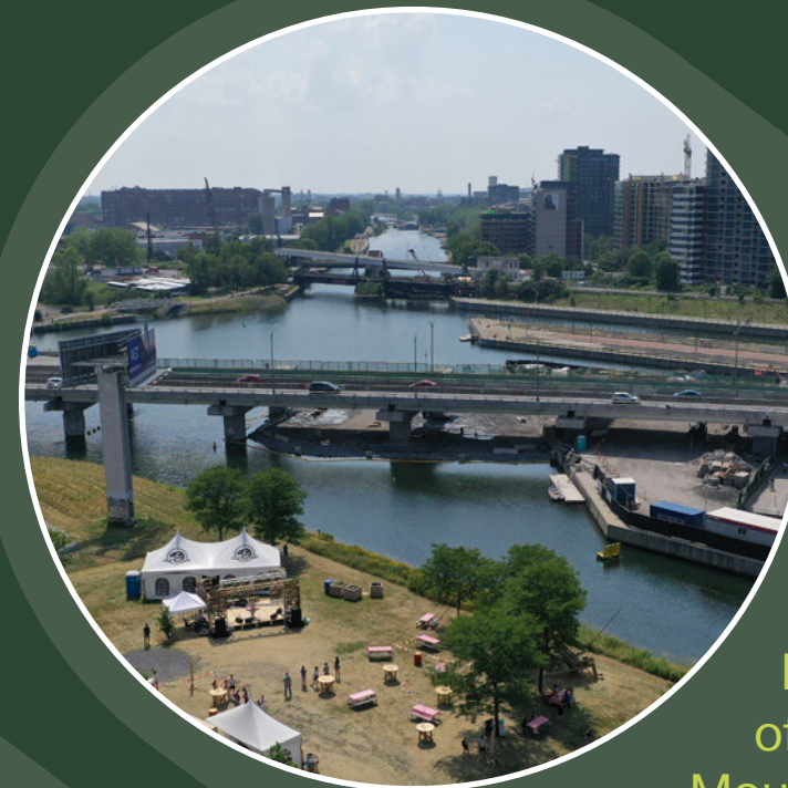
Redevelopment of the Pointe-du-Moulin area

Parks Canada actively participates in the events organized by the Office de consultation publique de Montreal (OCPM), including the information session, the consultation workshop and the symposium. In addition, Parks Canada submits a brief to share its vision for the development of the Bridge-Bonaventure sector.