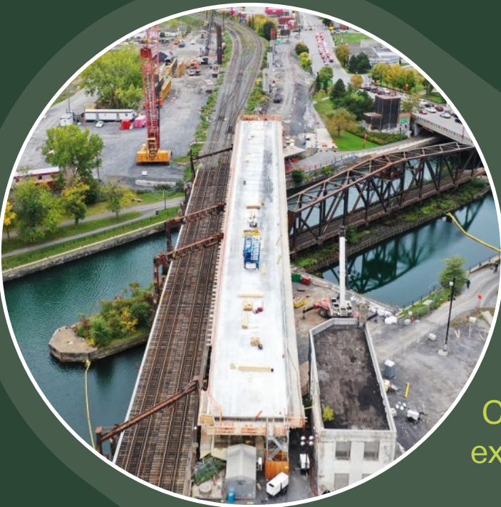
Construction of the Réseau express métropolitain

A particular orientation is developed for the Peel Basin sector, as it benefits from high visibility and major urban projects are underway in its vicinity.