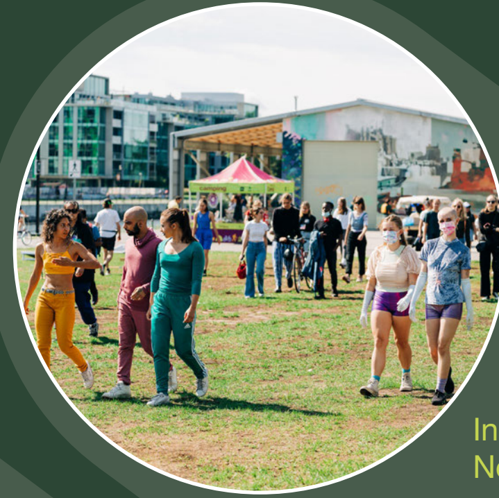
Inauguration of the North Link

This strategy aims to renew the facilities and services offered to better reflect the expectations of the various user profiles and the recent transformations of the adjacent neighbourhoods.