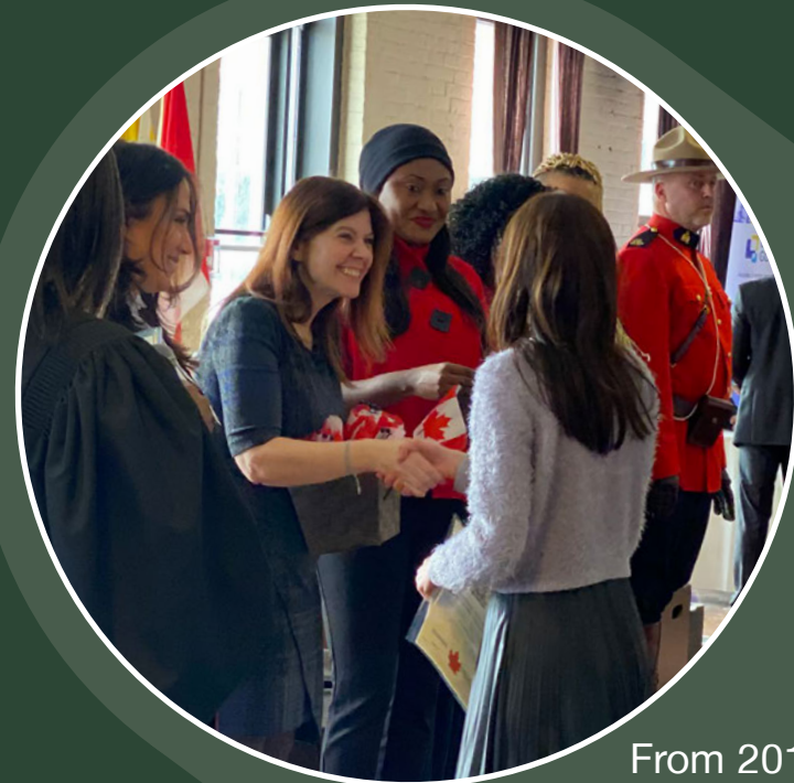
Swearing-in of new Canadian citizens

This strategy aims to take advantage of the canal's location in an urban setting to showcase Parks Canada's unique expertise and extensive network of protected places.