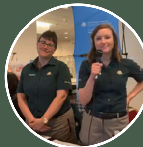
Public consultation Bridge-Bonaventure sector

Parks Canada actively participates in the events organized by the Office de consultation publique de Montreal (OCPM), including the information session, the consultation workshop and the symposium. In addition, Parks Canada submits a brief to share its vision for the development of the Bridge-Bonaventure sector.