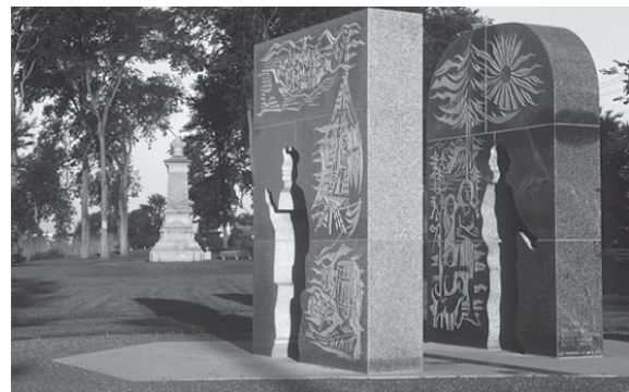
Monument to Donnacona and Jacques Cartier