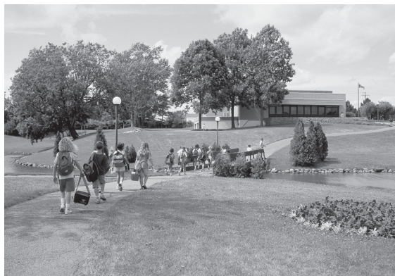
Cartier-Brébeuf National Historic Site

On June 24, 1889, the City of Québec created Cartier-Brébeuf Municipal Park. On this occasion, the Société Saint-Jean-Baptiste unveiled a monument erected by the Cercle catholique de Québec. The moment was designed to commemorate the wintering-over of Jacques Cartier and his shipmates on this site in 1535-1536, and the establishment in 1625 of the first residence of the Jesuit missionaries in Québec City.