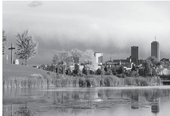
Panoramic view of Québec's Upper Town

The historic site is also rich in various other heritage values. In the southeast sector of the site, there is a cross erected in 1888 that recalls the landing of Jacques Cartier at this location. It was blessed by Pope John Paul II during his visit to Canada in September 1984. There is a granite monument unveiled during the Saint-Jean-Baptiste day celebration