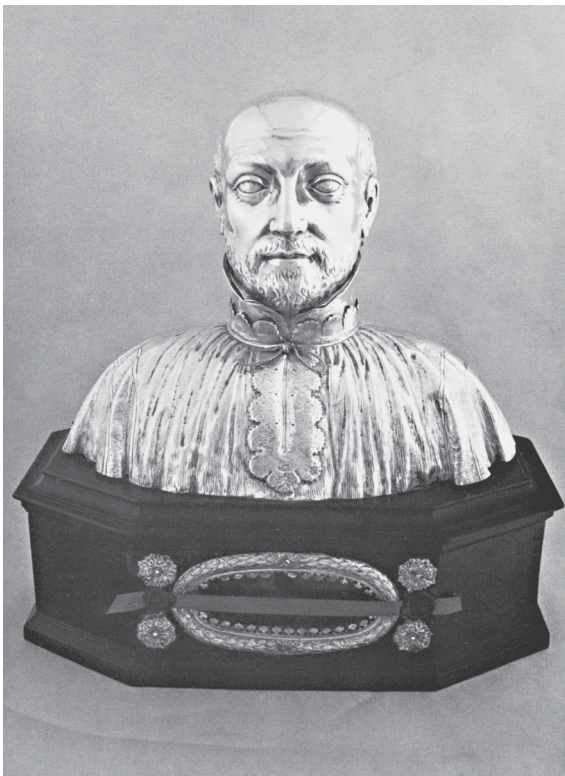
Reliquary of Father Jean de Brébeuf

began with the landing, in mid-June 1625, of five Jesuits at Québec City. Lodged for slightly more than two years by the Récollet Fathers, the newcomers built a modest residence on a portion of the land granted to them by the viceroy of New France. They dedicated its chapel to Notre-Dame-des-Anges. They also built a second building and sowed some crops. During this time, Father Jean de Brébeuf undertook his first stays among the Hurons. When Québec City was captured by the Kirke Brothers in 1629, the members of the Society of Jesus were expelled from the country. When they returned in 1632, they had to repair their residence and rebuild one section of the other building burnt by the invaders. They also erected a stake fence around the yard.