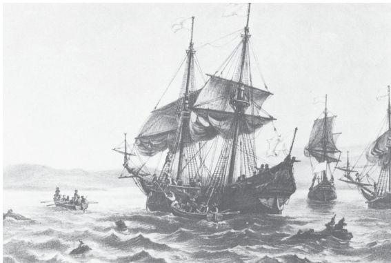
The arrival of Cartier at Stadacona

In 1534, after quickly crossing the Atlantic, Jacques Cartier came to the Strait of Belle-Isle and explored the Gulf of St. Lawrence, Gaspé Peninsula and Chaleur Bay. He finally found a route into the North American interior, but strong winds and opposing currents prevented the fleet from pursuing this route to its end. Winter was approaching and Cartier did not have sufficient provisions to continue exploring. So, he and his crew decided to return to France, but not before they had kidnapped two young Amerindian men