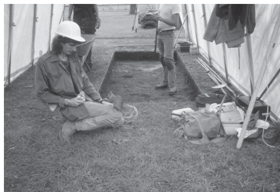
Archaeological excavations

Given the obsolescence of the Cartier-Brébeuf National Historic Site's reception and interpretation infrastructures, the primary issues to manage involve the knowledge, protection and presentation of cultural resources. Management measures have been proposed to ensure the commemorative integrity of these resources and the public safety. The implementation of these measures will contribute to strengthening the historic character and spirit of the place and, as a result, will have a positive impact on the quality of visitors' experience.