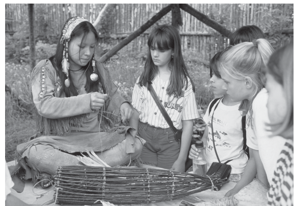
Costumed interpretation activity at the longhouse

Opened to the public in 1972, the interpretation centre was built at the top of the bank lining the northern shore of the pond. It includes a visitor information desk and souvenir counter, a modest exhibit (50 m 2 including the visitor information area) dating from the