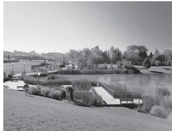
Recalling the confluence Saint-Charles and Lairet Rivers

To guarantee the satisfactory protection and presentation of national historic sites, Parks Canada has developed a Cultural Resource Management Policy . This policy is based on five major management principles: value, public benefit, understanding, respect, and integrity. As a rule, fulfilling the requirements of these principles is sufficient for assuring the commemorative integrity of a national historic site. In practice, the application of this policy signifies that the cultural resources have been identified and evaluated and their