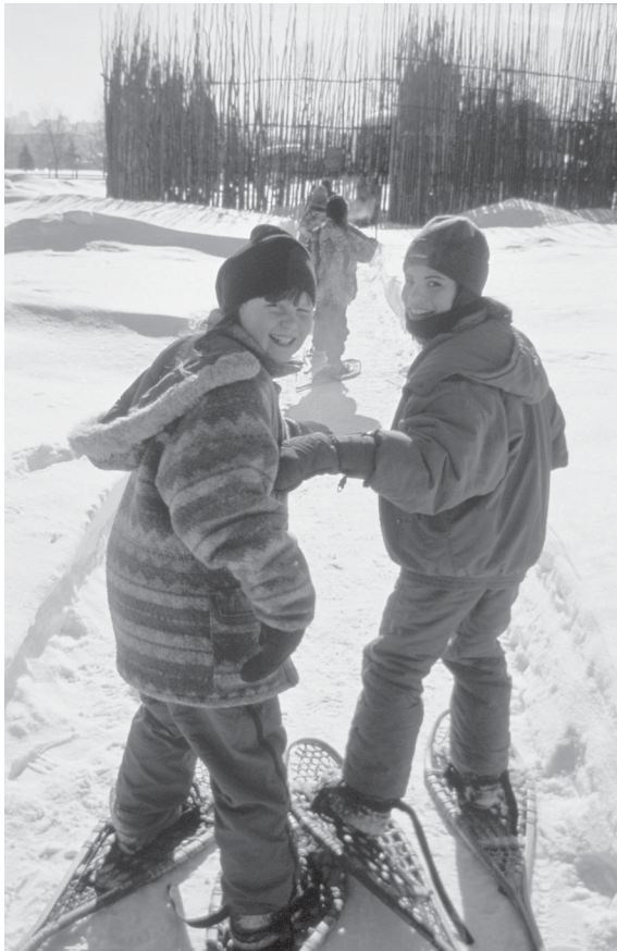
School activity

The playground groups are offered a customized program that is revised each summer. Further, seniors are offered a program centred on the Jesuits and the visit of Pope John-Paul II in 1984. Finally, in addition to its commemorative function, the site is also viewed as filling a use characteristic of an urban park, enabling the surrounding population to walk around, relax and picnic there. Among the members of the surrounding community, a strong feeling of attachment to the historic site can be felt.