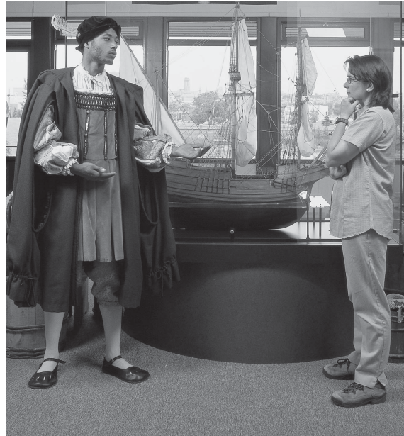
A costumed interpreter impersonating Cartier

The reasons justifying national historic site designation stated above can be better understood if they are supplemented with the following information: