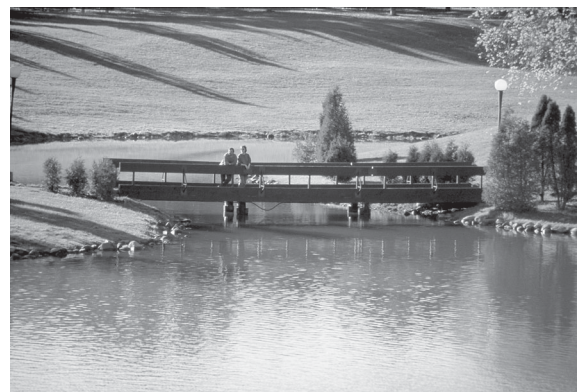
Recalling the presence of the Lairet River

The components that characterize the Cartier-Brébeuf National Historic Site landscape are the meeting point of the Lairet and Saint-Charles Rivers and the uneven slope on either side of the artificial pond. While the landscape has been significantly altered since Cartier's time, these components are still visible on site today.