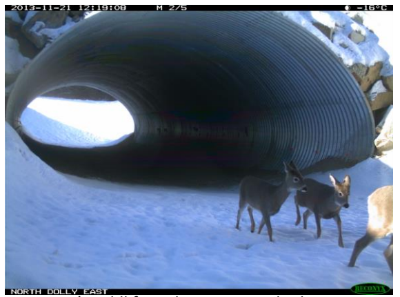
Kootenay's wildlife underpasses work; they improve ecosystem health and wildlife and motorist safety.