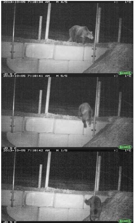
'Jump-outs' allow animals that have entered the fenced area to escape.

To keep animals from entering the fenced areas angular boulders have been piled adjacent to the fenced ends. The rocks work best for deterring hoofed animals. An electromat has also been installed at Kootenay Crossing. Electromats give animals an uncomfortable but harmless shock while having no effect on vehicles, bicyclists or pedestrians wearing shoes.