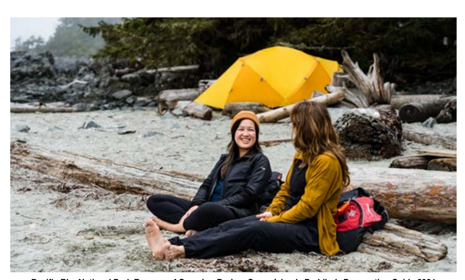
Pacific Rim National Park Reserve of Canada - Broken Group Islands Paddler's Preparation Guide 2024