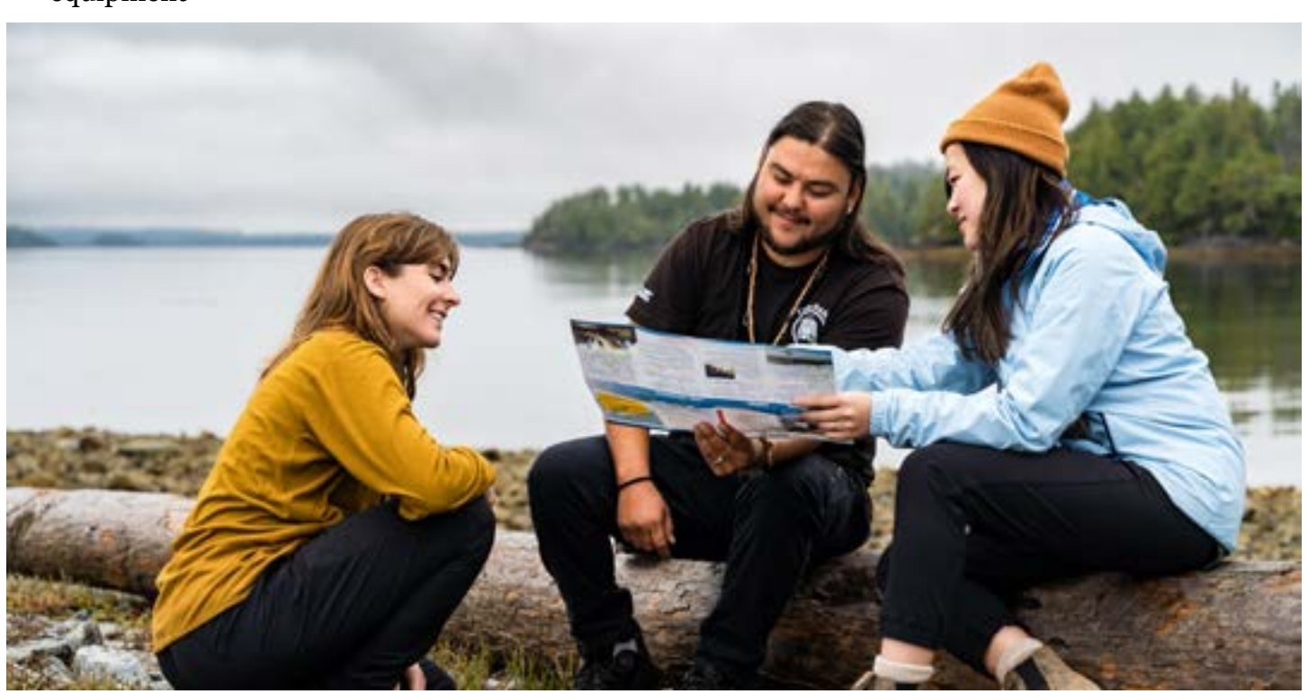
Pacific Rim National Park Reserve of Canada - Broken Group Islands Paddler's Preparation Guide 2024