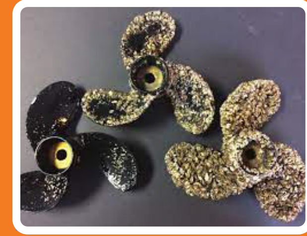
Propellers encrusted in mussels

Zebra mussels attached to watercraft, motors, docks and other surfaces are difficult to remove. If not physically removed, they can damage equipment, and block water flow. Dealing with them costs millions of dollars every year in Canada.