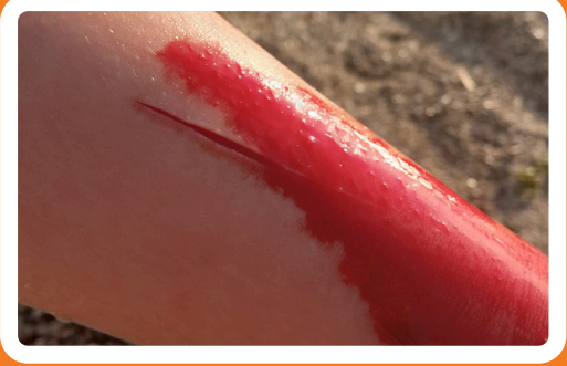
Arm cut by zebra mussel shell.

People protect themselves by wearing water shoes or other protective layers.