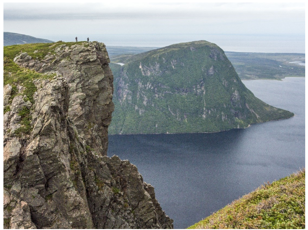
North Rim, S. Stone

2. Snug Harbour to North Rim (1-2 nights, 24 km) – Backpack the primitive Snug Harbour trail and camp at Snug Harbour. Then day hike to a viewpoint on the cliffs of the North Rim looking down on Western Brook Pond gorge.