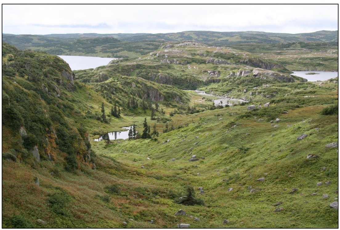
Reaching 800 metres out of the bogs along the Gulf of St Lawrence, the ancient Long Range Mountains mark the northern end of the Appalachian mountain range. The arctic-alpine bogs and barrens are home to caribou, moose, arctic hare, and black bear. (S.Stone)

The Long Range Mountains provides hikers with some of the most scenic and challenging hiking terrain in eastern North America. Hiking in the Long Range Mountains is physically and mentally challenging. It is remote, strenuous, and potentially hazardous. There are no built trails on the Long Range although there are a number of suggested backcountry routes. These routes are not marked with signs or maintained in any manner. Hikers need backcountry travel experience, be self-reliant, and proficient using maps, compass, and GPS to navigate unfamiliar wilderness terrain.