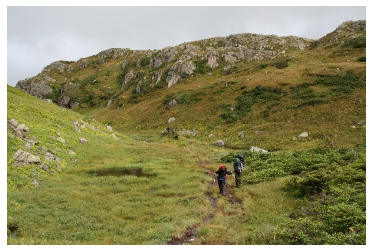
Long Range Traverse, S. Stone

6. Combined Northern and Long Range Traverse (5-7 nights, 60 km) – For a longer backpacking route, combine the Northern traverse and Long Range traverse. Access the Long Range plateau by Snug Harbour and then follow the routes east and south towards Gros Morne Mountain.