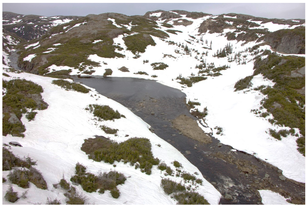
Hikers should expect to encounter large snow beds along the route from mid June to early July. (M.Anderson)