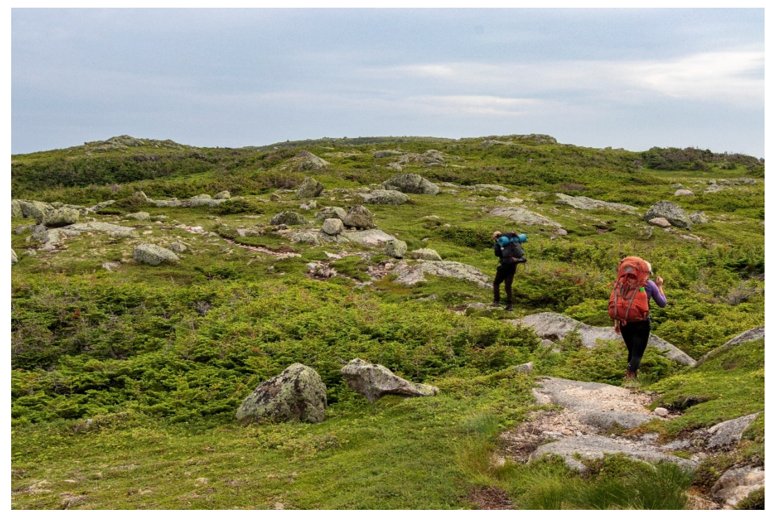
Warmer and drier summer weather from mid July to late August make for some of the best hiking conditions on the Long Range but expect more blackflies.