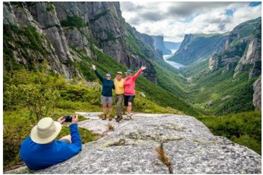
Western Brook Pond gorge

1. Western Brook Pond Gorge (7-8 hours) – enjoy a challenging guided day hike to the top of Western Brook Pond gorge with Out East Adventures and Bontours. For all additional information on this experience, visit <a href="www.bontours.ca">www.bontours.ca</a> or call 1-888-458-2016.