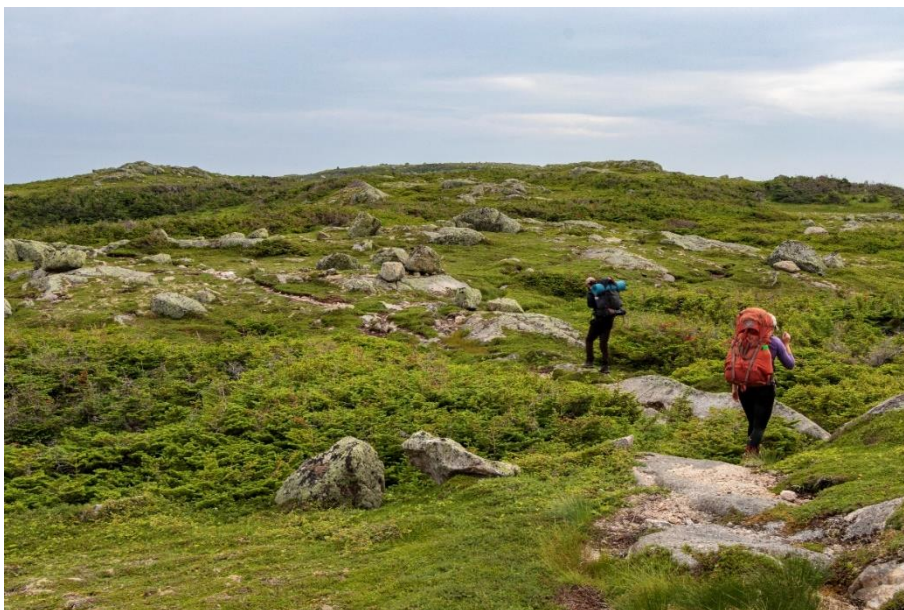
Warmer and drier summer weather from mid July to late August make for some of the best hiking conditions on the Long Range but expect more blackflies.

For many hikers, summer's warmer temperatures and greater possibility of extended periods of dry sunny weather make this the preferred time to hike in the Long Range Mountains. Expect fewer and smaller snow beds. Water levels in brooks and ponds tend to be lower, making brook crossings easier. Expect more blackflies, sometimes enough to make travel very uncomfortable.