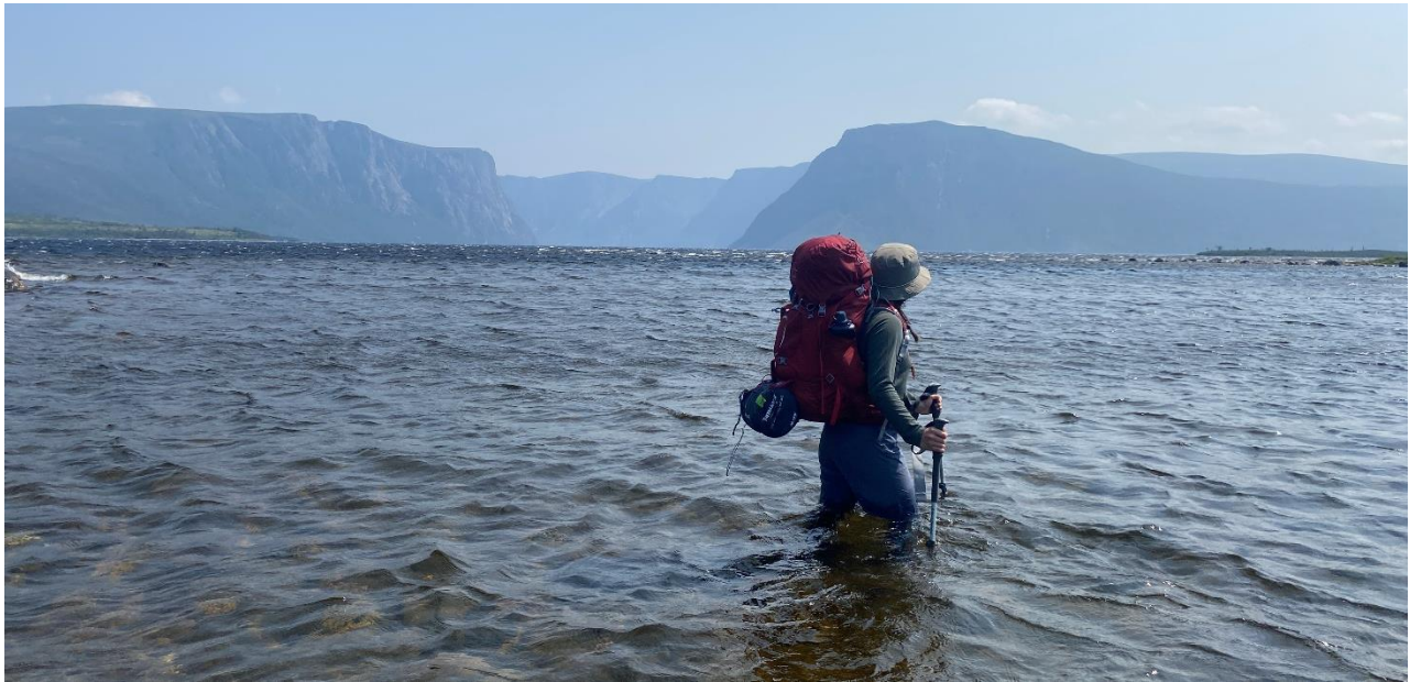
Fording Western Brook