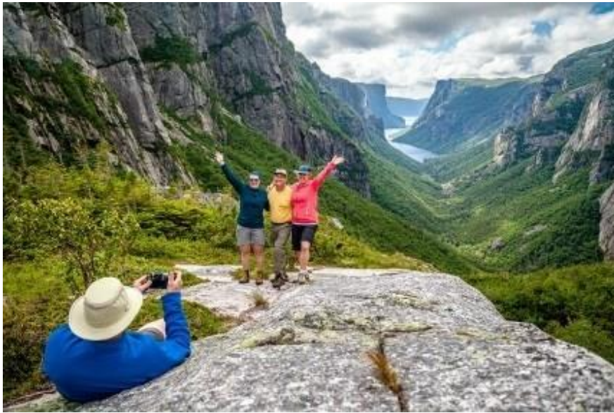
Western Brook Pond gorge, Newfoundland and Labrador Tourism

top of Western Brook Pond gorge with Out East Adventures and Bontours. For all additional information on this experience, visit www.bontours.ca or call 1-888-458-2016.