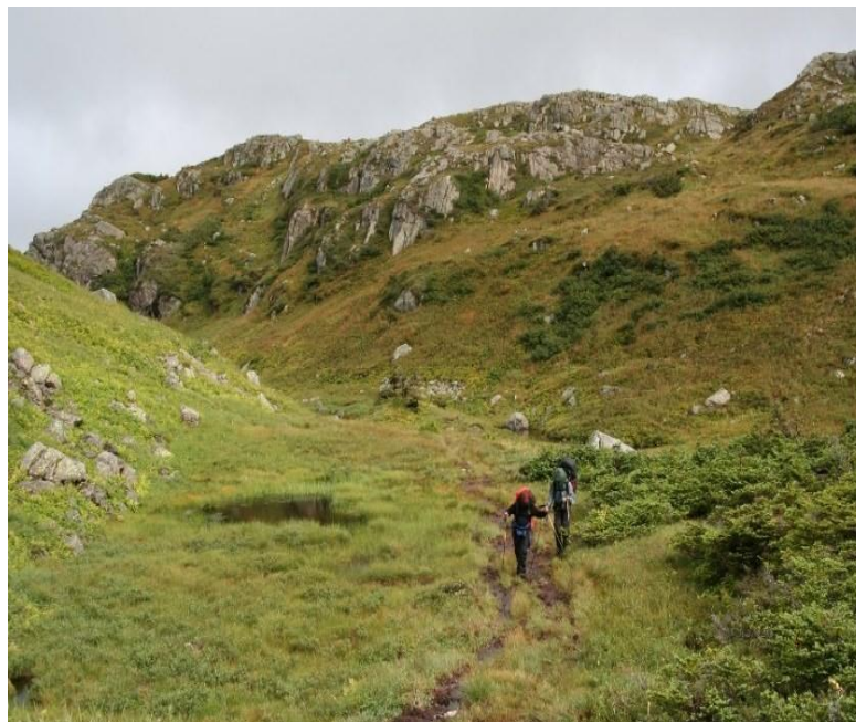
Long Range Traverse, S. Stone

Hiking times are estimates. Actual times will vary due to weather, delayed departures of the boat shuttle, and individual ability of hikers. Hikers are advised to plan for delays and allow for extra time to complete the hike.