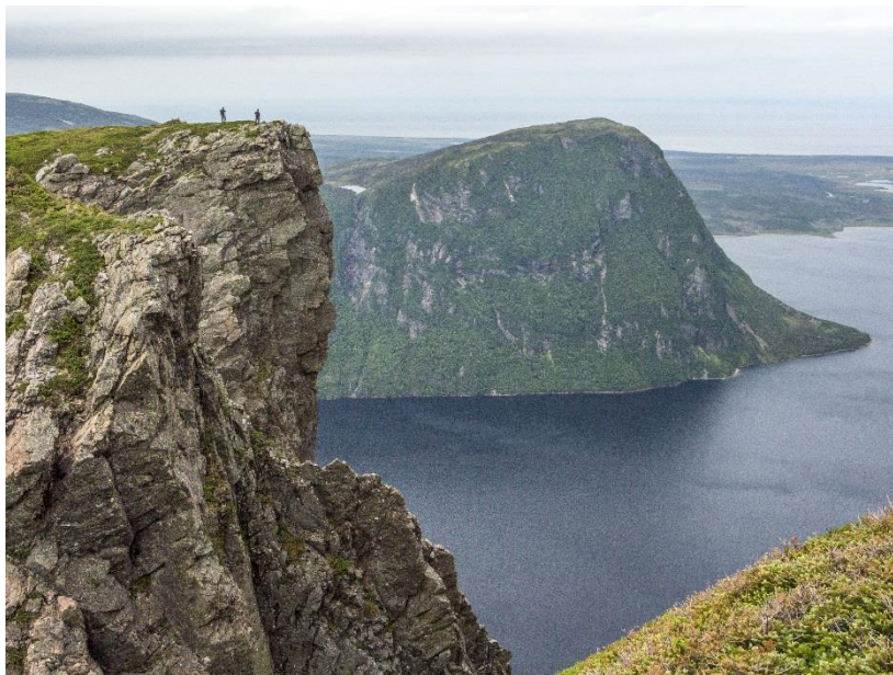
North Rim