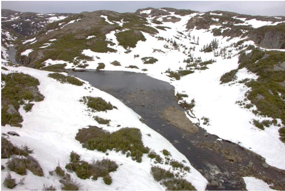
Hikers should expect to encounter large snow beds along the route from June to early July. (M.Anderson)