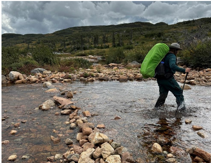
Stream crossing near Marks Pond.

Stream crossings – all routes require you to cross multiple streams. There are no bridges at any of the stream crossings. Water levels will fluctuate. Expect higher water levels after heavy rains or during spring snow melt.