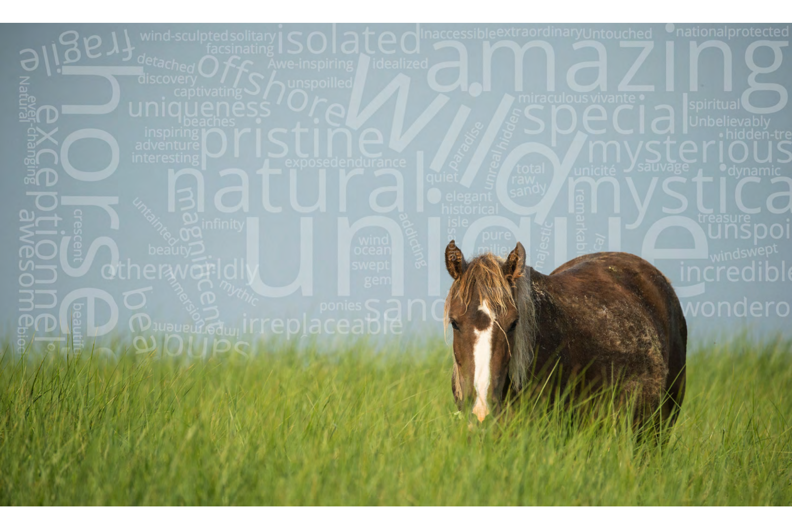
Figure 2: Word cloud: If you had to describe Sable Island to someone who has never heard of it before using one word, what word would you choose? Responses presented from over 1,000 participants. The font size of words corresponds to their frequency of use by participants; i.e. larger words were used by many participants, and smaller words were used by fewer.

In the minds of many participants, Sable Island NPR is perceived to be a pristine environment with little human intervention. This vision is in contrast to the 400+ year legacy of human use, which remains present in the form of dilapidated buildings and refuse. However, its value and meaning is often derived from this perception and maintaining its sense of wonder is an important aspect of many participant's vision for Sable Island NPR. The feelings and images that participants associate with Sable Island NPR are presented in the form of a word cloud (Figure 2).