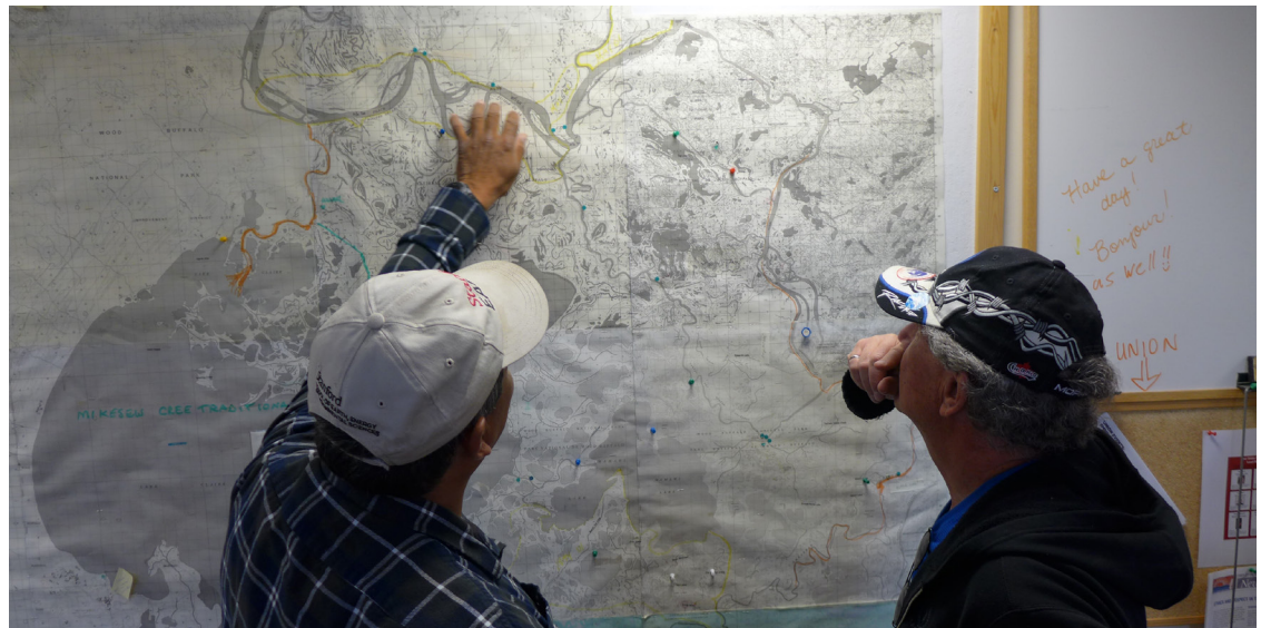
Workshop participants in Fort Chipewyan discuss a map of the Peace-Athabasca Delta in southern Wood Buffalo National Park. Consultation is a vital step in shaping the SEA.

A Draft Scoping Report was circulated in August 2017. The report was shared with Indigenous groups, government departments, NGOs, industry groups, the World Heritage Committee, and the public. Comments