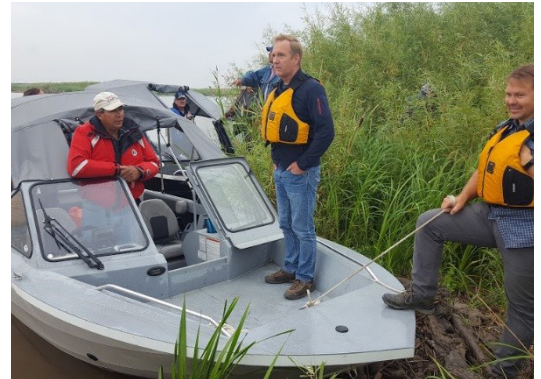
Parks staff journey into the Peace-Athabasca Delta with local traditional land users and consultants.

The purpose of the SEA is to provide an independent assessment of the activities and trends that may threaten the health or integrity of the park's world heritage values. There are other studies that present information on possible impacts that might affect the park, but the SEA is an effort to assemble a collective view of cumulative impacts.