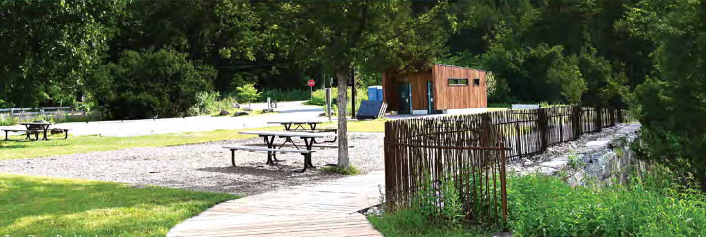
Twyn Rivers Day Use Area