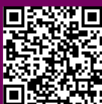
Twyn Rivers Day Use Area