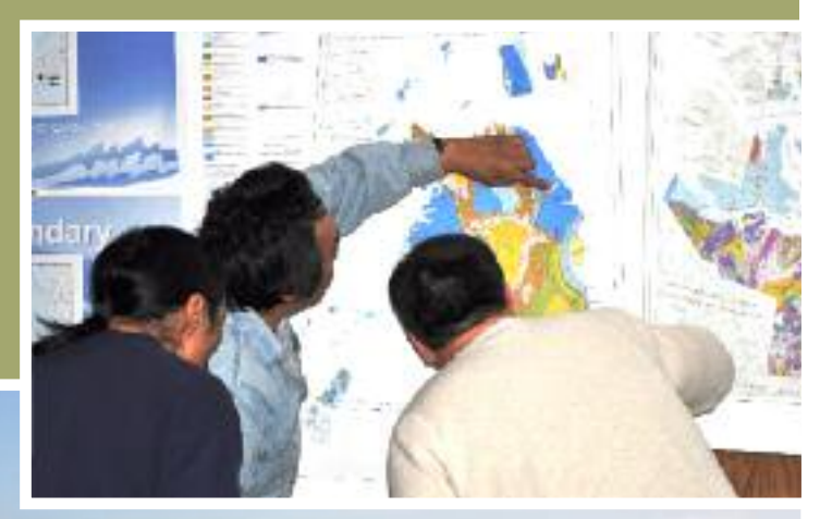
Resolute community participated in information sessions about the national park proposal in September 2010