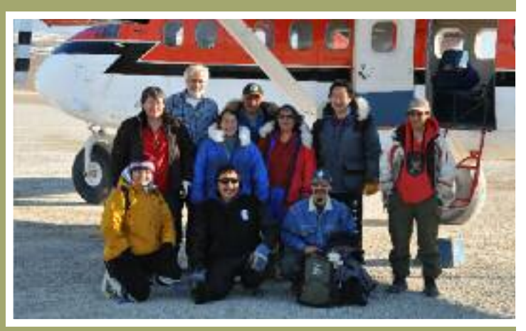
Resolute community members participated in a field trip to Bathurst Island in September 2010